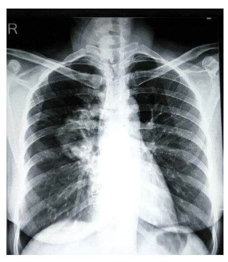
Figure 1: Chest x-ray showed ill-defined rounded heterogeneous opacity.

A 35 years old female presented with streaky hemoptysis since seven days, without associated chest pain, fever, cough and expectoration. Her chest x-ray showed ill-defined rounded heterogeneous opacity, size approximately 5 \times 3 cm in right para hilar region (Figure 1). A differential diagnosis of para hilar mass, cavitatory lesion (tuberculosis, fungal cavity, hydatid cyst and lung abscess), arterio-venous malformation and calcified lymph node was made. Clinical examination of the patient showed no abnormality. To evaluate further, right lateral chest x-ray was advised, surprisingly which was absolutely normal (Figure 2). Retrospectively, we re-examined the patient and found a topknot over her back of chest lying in inter-scapular area, raised a suspicion of topknot as the possible cause of radiological opacity. A repeat chest x-ray with the high tie up of topknot over head with hair clips was advised, Surprisingly, which was also absolutely normal (Figure 3).