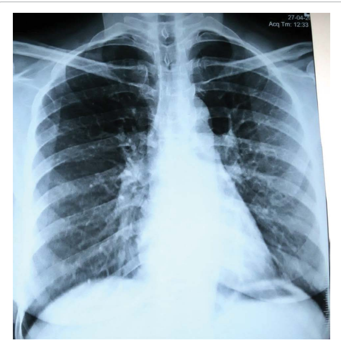
Figure 3: A repeat chest x-ray with the high tie up of topknot over head with hair clips.

On the same day, another lady presented with signs and symptoms of bronchial asthma but her X-ray chest showed right sided paratracheal homogenous opacity extending up to neck and lateral X-ray similar to previous case was normal. Repeat X-ray after high tie up of her topknot was also normal (Figure 4a-4c).