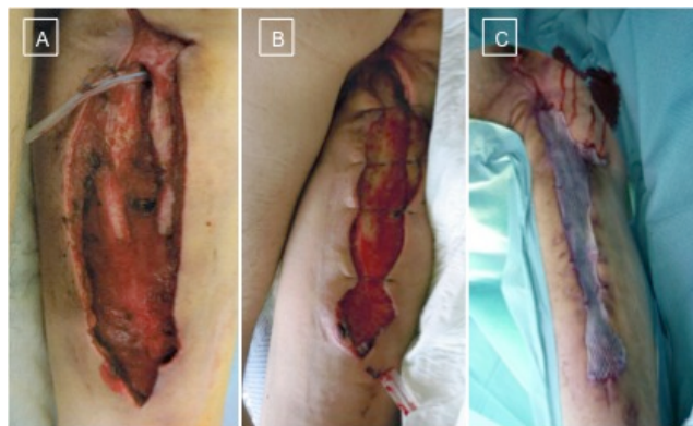
Figure 3: Right posterior thigh after surgical splitting of the fistula. (A) Proximal is the perianal drainage visible. (B) Wound after conditioning. (C) Wound after covering with split-skin graft.

year later the patient was meanwhile treated with adalimumab and azathioprine. He presented with two new fistulas and ten days later with a recurrent abscess at the right thigh, all treated surgically. The follow-up after the last surgery is now five months.