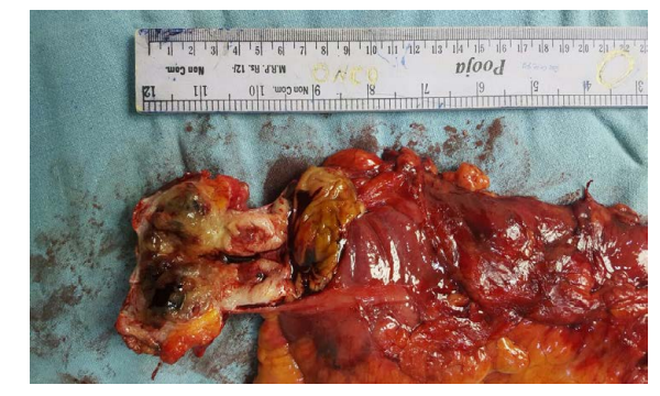
Figure 4: Specimen of right hemicolectomy with appendicular growth and wedge resected specimen of urinary bladder entoto.