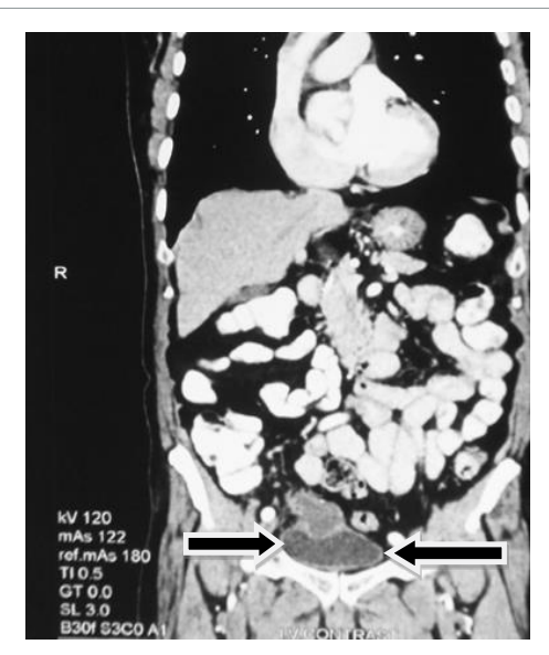
Figure 1: CECT abdomen showing a heterogeneously enhancing oblong mass lesion with the tip of the lesion having an ill defined interface with the dome of the urinary bladder suggestive of infiltration.