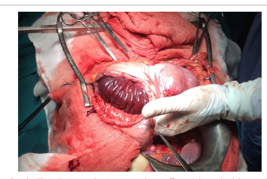
Figure 2: A dilated stomach stump and an efferent intestinal loop which had intussuscepted in a retrograde direction into the remnant gastric lumen, passing over the gastrojejunostomy.

Figure 1: CT showing a distended stomach with an intragastric filling by bowel loop.