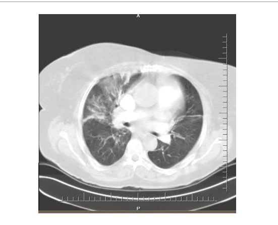
Figure 2: Widespread increase in alveolar density in the computerized tomography section (Case 2).