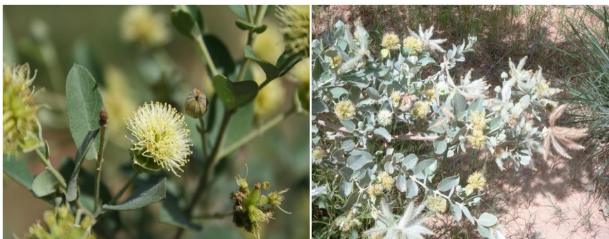
Figure 1: Close view of Guiera senegalensis .

mucronate at the apex, rounded or slightly cordate at the base. About 2 to 4 cm long by 1 to 2 cm wide, softly tomentose on both surfaces, with scattered black glands beneath lateral nerves fine. Flowers globose heads, yellow-greenish, resting on short axillary peduncles. Calyx of 5 lobes densely covered by black spots, corolla of 5 petals, the stamens are 10 on two rows of 5, all inserted on the calyx [4,6,7]. The ovary has a single box containing 4 to 6 eggs [8]. Fruit narrowly cylindrical, radiating, 3.5 cm long, densely clothed with very long silky hairs, making a fluffy head (Figure 1). Flowers Sept.-Jan.; Fruits Feb.-May [6].