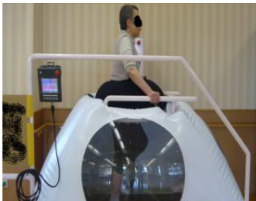
Figure 2: Treadmill walking sessions: lower body positive pressure (LBPP) exercise. A patient wore neoprene shorts with a kayak-type skirt attached at the waist. Then, he/she stepped into the lower body positive pressure (LBPP) chamber and the compliance properties of the skirt were such that a subject was able to walk comfortably on an electronically controlled treadmill without leaning on the seal for support. Seal height was adjusted to the level at each subject's iliac crest, so that the seal itself exerted little or no vertical force when at ambient pressure.