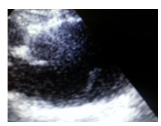
Figure 2c: Enlarged parasternal view showing mobile intimal flaps in the aorta.