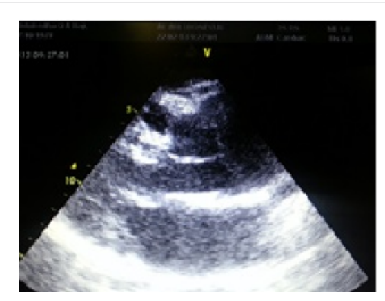
Figure 2a: Echocardiogram showing intimal tear/flap.