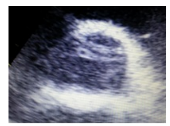
Figure 2b: Echocardiogram (short axis) showing intimal flap in aorta.