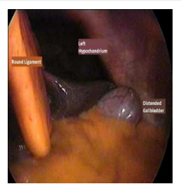
Figure 4: In per-surgery: Gall-bladder located at the level of the left hypochondrium, to the left of the round ligament.