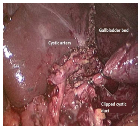
Figure 6: Clipped cystic duct.