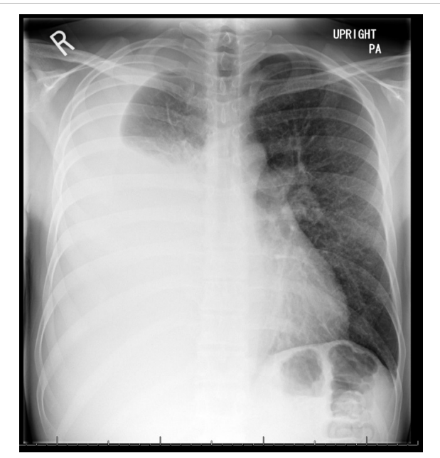
Figure 1: Chest radiograph upon initial presentation with near complete right sided opacification.

Of the estimated 222,500 new cases of lung cancer diagnosed each year, less than 2% are in patients younger than 45 years old. The risk