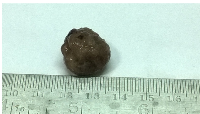
Figure 3: Macroscopic appearance of the polyp after resection.

Few cases of Gastric polyp mimicking hypertrophic pyloric stenosis in infancy have been reported in literature [5]. In infancy haematemesis as a presentation of polyp is rarer; so far only one case was reported whose sole presentation was haematemesis [6]. Present case has a significant haematemesis to drop her haemoglobin to 6.5 gm.