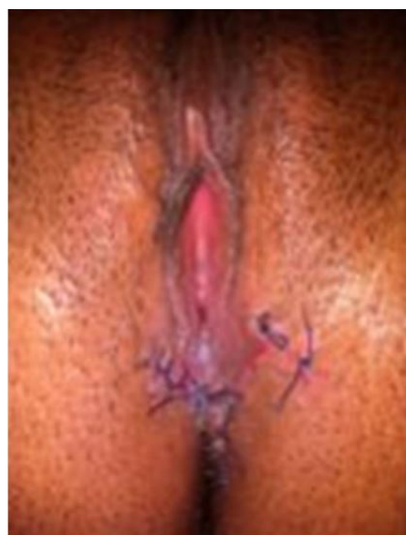
Figure 2: Genital appearance after treatment. Reconstruction of the vulva after cold knife surgical excision.

Histopathological examination of the resected tissue, revealed massive epidermal hyperplasia, hyperkeratosis and parakeratosis (Figure 3a). Some keratinocytes had nucleus with prominent nucleoli and large cytoplasm. Keratinocytes with granular vacuolization exhibited large cytoplasm and nucleus with large prominent and visible nucleoli. Tumor cells have discrete cytoplasmic nuclear atypia (Figure 3b), but they were not detected in blood or lymphatic vessels. Rounded masses are also observed that invade the dermis and contiguous structures (Figure 3c). Condyloma acuminatum was excluded because histopathological images thickening of the stratum corneum, endophytic increases and deeper invasion argues for giant condyloma. Final histopathology findings were consistent with the diagnosis of Buschke-Löwenstein tumor. Adverse events and infective complications were not observed. It was performed a dressing after 10 days of surgery; the first follow-up programmed to one month showed the restitutio and integrum. After radical surgical excision, the patient showed no local recurrence signs during four years of follow-up. This study was approved by the Catanzaro University Hospital Ethical Committee in compliance with the Declaration of Helsinki. Informed written consent was obtained by the patient for publication of this case report and any accompanying images.