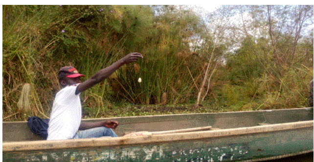
Figure 4: An illegal fisher displaying a fishing hook baited with ugali .

The legal fishers set gillnets overnight and lift them at dusk and then proceed to sell them to the traders/middlemen at the fish landing beaches. By 8.00 am they return to the lake to start fish angling. It has been observed that fishers using this technique can harvest approximately 15 Kg or (20 pieces) of fish within three hours which is three times more than what they harvest from gillnetting (Figure 5). It was also observed that the fishers use hooks of different sizes ranging between 8 and 12 inches targeting mainly brooders.