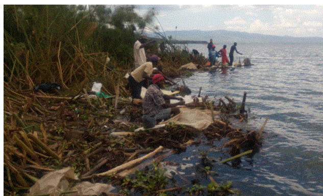
Figure 6: Environmental degradation along the papyrus fringes.

From an environmental perspective, illegal angling has totally changed the landscape of Lake Naivasha due to the large deposits of plastic waste that are strewn all over the riparian zones and particularly in areas with papyrus fringes and macrophyte population which act as refugee for fish and other water birds have been degraded and in some cases completely destroyed as a result of their fishing activity (Figure 6).