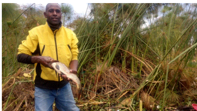
Figure 3: Carp is the target species of angling.

Illegal Angling has also been observed to be an emerging fishery in Lake Naivasha being practiced by both legal and illegal fishers. It is a selective fishing method in nature targeting a particular species and had been previously introduced in Lake Naivasha strictly for sport fishing with black bass or Micropterus salmoides being the target species. However with the dwindling catches of the common carp which since 2002 constituted up to 95% of the total annual fish landed from Lake Naivasha, the fishers have resulted to engaging in intensive fishing using the hook and line. The fishing lines are tied on to the papyrus vegetation along the lake shore or on the boats. (Figure 2). Illegal fishers practicing this fishery use ugali or boiled maize as bait for the carp species (Figures 3 and 4).