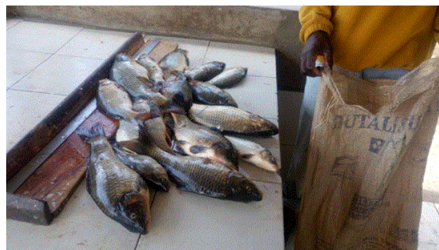
Figure 5: Total harvest from three hours of angling near Kamere beach.

The legal fishers set gillnets overnight and lift them at dusk and then proceed to sell them to the traders/middlemen at the fish landing beaches. By 8.00 am they return to the lake to start fish angling. It has been observed that fishers using this technique can harvest approximately 15 Kg or (20 pieces) of fish within three hours which is three times more than what they harvest from gillnetting (Figure 5). It was also observed that the fishers use hooks of different sizes ranging between 8 and 12 inches targeting mainly brooders.