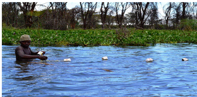
Figure 2: Active fishing using illegal gears on fish breeding areas.

Illegal Angling has also been observed to be an emerging fishery in Lake Naivasha being practiced by both legal and illegal fishers. It is a selective fishing method in nature targeting a particular species and had been previously introduced in Lake Naivasha strictly for sport fishing with black bass or Micropterus salmoides being the target species. However with the dwindling catches of the common carp which since 2002 constituted up to 95% of the total annual fish landed from Lake Naivasha, the fishers have resulted to engaging in intensive fishing using the hook and line. The fishing lines are tied on to the papyrus vegetation along the lake shore or on the boats. (Figure 2). Illegal fishers practicing this fishery use ugali or boiled maize as bait for the carp species (Figures 3 and 4).