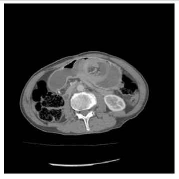
Figure 2: CT discloses a target shaped mass (arrows) compatible with Jejunal loops in the stomach.