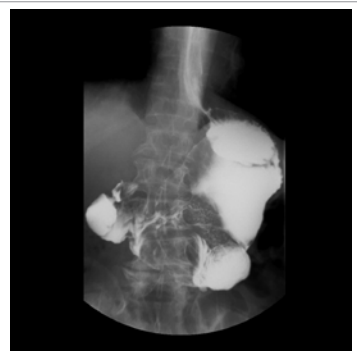
Figure 1: Contrast is passing to duodenal C loop (arrow) but not to jejunum.

Our patient is a 54 year –old man who had gastrojejunostomy 10 years ago. He presented to emergency service with abdominal pain, vomiting and hematemesis. His white blood cell was 16.05 K/uL, blood urea nitrogen was 22.4 mg/dl, creatinin was 2.2 mg/dl. The patient was dehydrated; laboratory investigation showed increased blood leucocyte, urea and creatinin levels. On Gastrography examination, there was filling defects due to intussuscepted jejunal loops in the distanded stomach lumen. Contrast was passing to duodenal C loop but not to