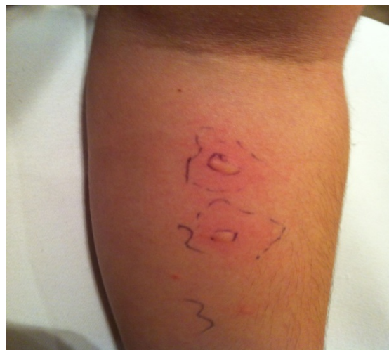
Figure 2: Positive skin prick test to Amoxicillin (1st upper) and Co Amoxycylav (2nd upper) defined as a wheal and flare. Negative to Cefuroxime (lower).

Patch testing is also used to evaluate non IgE mediated drug reactions. This is done using certain concentration of a drug mixed into petroleum or 0.9% saline and applied to a small area of skin covered for 48 hours. This is then removed and the area examined 48-96 hours from the start of the test [12].