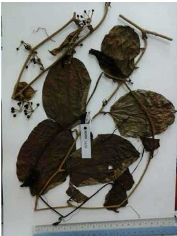
Figure 1: Voucher specimen of Smilax bracteata C. Presl. (BORH No. 2456).