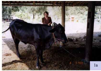
Figure 1: First cloning heifer Ing (Brangus, picture 1-a) in twinning with AI male OUN (picture 1-b), they were born on 6 March 2000, picture with Professor Maneewan Kamonpatana took on 4 th March 2003 when Ing was nearly 3 years old.