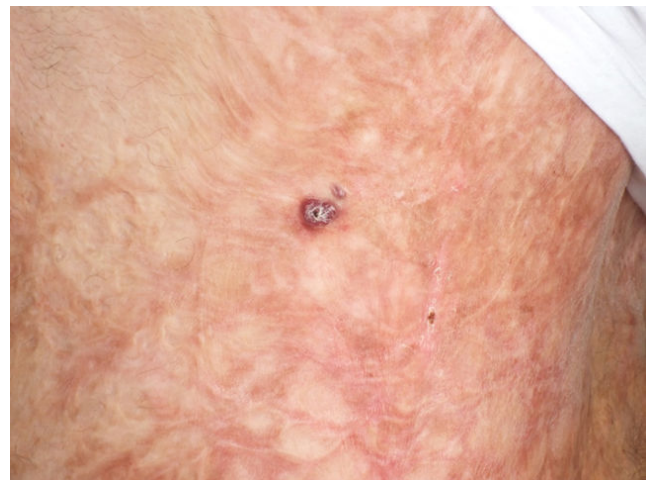
Figure 1: Patient with wide contracted burn scar located at the middle of the back and two ill-defined nodular lesions, 1.3 and 0.5 cm in diameter.

A 31-year-old male patient with a history of a thermal burn 20 years ago, admitted to plastic surgery service in Medipol Mega Hospital with the complaint of an intractable ulcer on his left side of mid-back despite conservative treatment for 6 months. On physical examination, there was an extensive burn scar affecting his entire back. On the scar area two exophytic nodular lesions were seen with erythematous scaly appearance, 1.3 cm and 0.5 cm in size with 0.2 cm distance in between (Figure 1). The surrounding skin showed mild contracture. Wide excision and split-thickness skin graft were performed with a clinical diagnosis of Marjolin's ulcer.