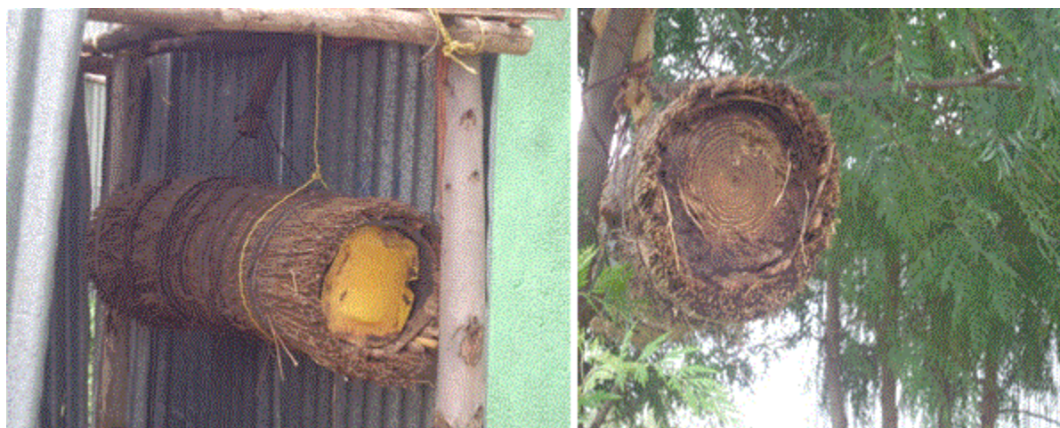
Figure 1: Placement of traditional hive in Haramaya District, 2014. Hives under shed and hives under tree.

Cross-sectional study was conducted to collect data using questionnaire survey. Beekeepers in the district represented the study population. Using a purposive sampling procedure, a total of twelve kebeles (villages) were selected based on agro-ecology representation (high-land, mid-land and low-land), honey production potential and accessibility. The sampling units were households keeping honeybee colony. Information about the type of hives used, the number of bee colonies owned, the purpose of keeping honey bees, the marketing system of honey and other hive products, the rate of absconding and swarming and harvesting and processing of hive products and major constraints of beekeeping were collected through interviews using a semi-structured questionnaire.