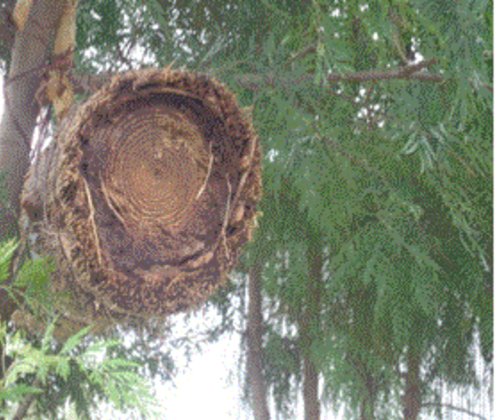
Figure 1: Placement of traditional hive in Haramaya District, 2014. Hives under shed and hives under tree.