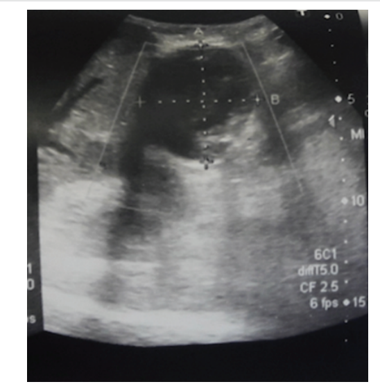
Figure 1: Nor clear anechogenic features of a cystic lesion.

Abdomen ultrasound (US) examination revealed a circular mass (6 × 5.5 cm) in the right hypochondrium, which had no typical HCC vascular pattern (as we had expected due to her chronic HCV liver disease), nor clear anechogenic features of a cystic lesion (Figure 1). The instrumental exam also showed hepatomegaly with disomogeneous tissue and enlarged sovrahepatic veins as signs of either advanced stage of cirrhosis or severe right heart failure. Magnetic Resonance (MR) was not indicated due to the presence of cardiac mechanical valves. Abdomen computed tomography (CT) revealed a 65 mm diameter cystic mass in the fifth hepatic segment, with regular profile, small parietal calcifications and irregular content (Figures 2A and 2B). A clinical diagnosis of hydatid cyst was run out by the negative hydatid sierology and the clinical history. The patient refused to undergo surgical resection due to her high anesthesiologic risk because of several comorbilities. Although we don't have a histological examination, according to the previous histological diagnosis of biliary cystadenoma occurred in 2009, we suspect its possible recurrence.