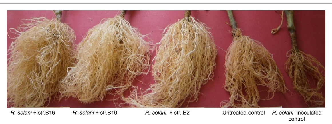
str. B2: Bacillus thuringiensis (KU158884); str. B10: B. subtilis (KT921327); str. B16: Enterobacter cloacae (KT921429).

This analysis indicated that the lowered Rhizoctonia Root Rot severity on tomato plants, allowed using rhizobacteria-based treatments, was linked to the registered growth promotion.