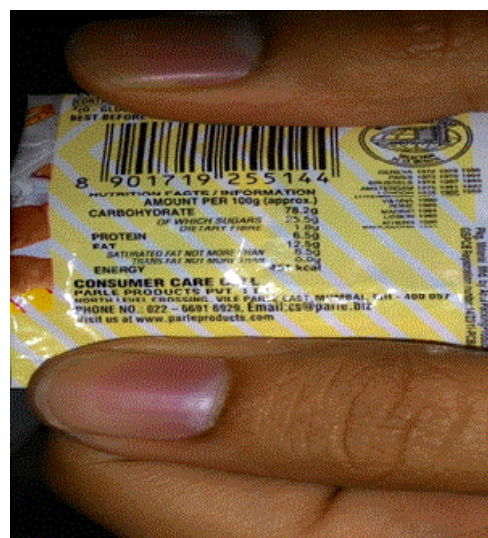
Figure 1: Protein content of biscuit made by using only wheat flour is low.

things as same, but a difference in the protein content between the two types of biscuits can be tested and a very slight difference in the taste between them can also be felt (Figure 1). It was clear that the protein content of the biscuit having banana and cashew having as its ingredients contain more protein level than the biscuit which was made by using wheat flour only (Figure 2).