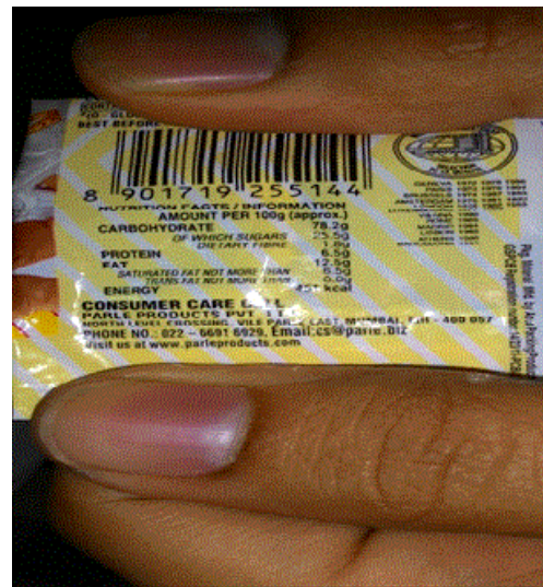
Figure 1: Protein content of biscuit made by using only wheat flour is low.

things as same, but a difference in the protein content between the two types of biscuits can be tested and a very slight difference in the taste between them can also be felt (Figure 1). It was clear that the protein content of the biscuit having banana and cashew having as its ingredients contain more protein level than the biscuit which was made by using wheat flour only (Figure 2).