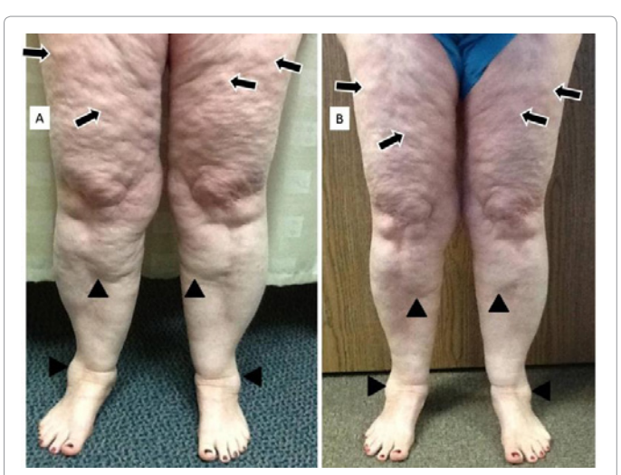
Figure 2: Photograph of patient's lower extremities pre and post- treatment. A) Patient's lower extremities 6 days after initiation of selenium and before physical therapy. Note the raised areas of thin skin in a bubble pattern all over the thighs (some denoted by arrows) and the fat pads on the anterior shins below the knees as well as the pockets of fat on the lateral malleoli (arrowheads). Note also the lack of increased fat on the foot. B) Patient's six month reassessment post treatment and on the last day of perometry measurement (day 293) while taking selenium, Butcher's broom and off pioglitazone. Note that there are fewer raised areas of thin skin in a bubble pattern on the thighs, and that the fat pads below the knee and around the malleoli appear decreased, but are not absent.

extremity. The patient did not undergo compression bandaging of her upper extremities secondary to reports of pain after the first visit of compression bandaging of the left upper extremity but did undergo MLD with HIVAMAT for bilateral upper extremities for four visits each limb.