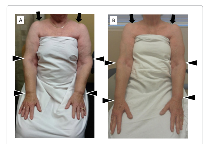
Figure 1: Photograph of patient's bilateral upper extremities pre and posttreatment. A) Patient's upper extremities 6 days after initiation of selenium and before physical therapy. Note the indentations in the skin and fat from the bra straps (arrows), and the enlarged fat deposits in the cubital areas (upper arrowheads), and the cuffs of fat at the wrists (lower arrowheads) with a lack of increased fat on the hands. B) Patient's six month reassessment post treatment on the last day of perometry measurement (day 293) while taking selenium, Butcher's broom and off pioglitazone. Note the reduction in fat in the cubital areas (upper arrowheads) and complete absence of the cuff of fat at the wrist on the right arm (lower arrowhead).

The patient underwent physical therapy 4-5 times per week for 6 weeks, during which time she continued her selenium. The patient received MLD with HIVAMAT, and compression bandaging for three weeks for the right lower extremity, and one week for the left lower