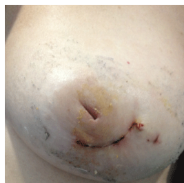
Figure 2 : Patient's left breast after intervention