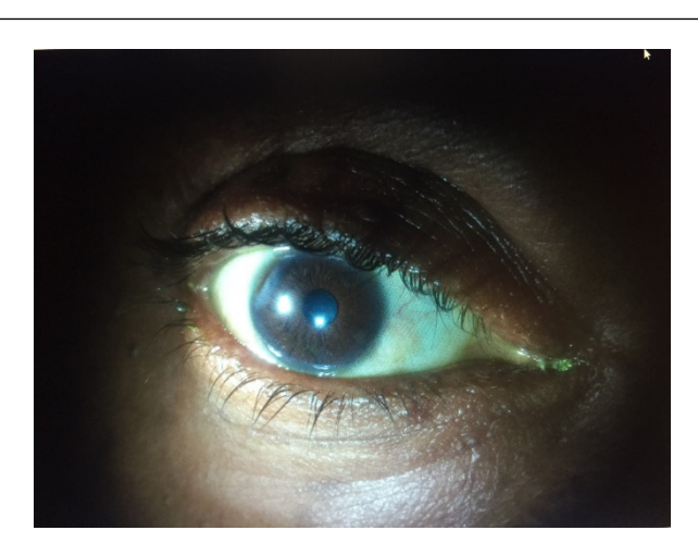
Figure 2: Slit lamp photograph of right eye with a superotemporal corneal scar but overall benign ocular surface, second presentation after ocular surface treatment and Vitamin A supplementation.

The temporary tarsorrhaphy in both eyes was discontinued. The next week, the patient's BCVA remained 20/20 in both eyes, with significantly improved PEE and edema. Her treatment regimen was switched to artificial tears every 3-4 hours as needed, Refresh Lacrilube© ointment four times daily, and Restasis© twice daily. At followup day 45, the patient's BCVA was stable at 20/20 in both eyes, with a benign ocular surface on exam. A timeline of therapeutic interventions following diagnosis is presented in Table 2.