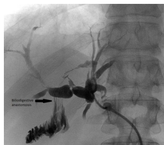
Figure 1: Percutaneous drainage with contrast agent showed connection to the Y-loop