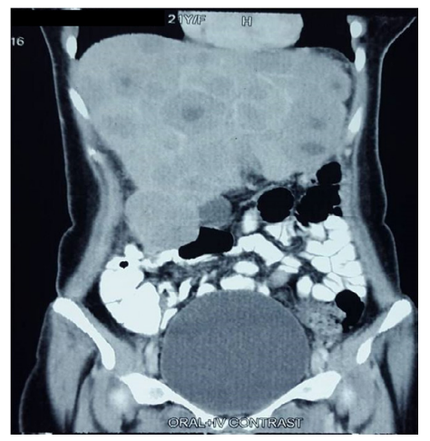
Figure 2: USG showed multiple hypoechoic lesions in liver and tail of pancreas.