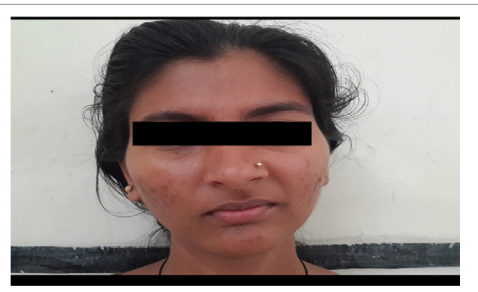
Figure 1: Female presented facial flushing.

NET of pancreas is classified as functional and non-functional. Carcinoid of pancreas are extremely rare amounting to 0.73% of all carcinoid tumours [1]. Carcinoid syndrome is usually caused due to extensive liver metastasis causing release of vasoactive substances