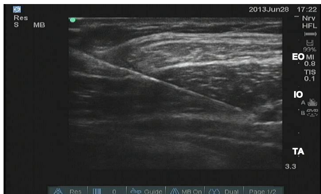
Figure 2: Ultrasonographic view of a 21-gauge 100 mm Stimuplex needle® advancing towards the transversus abdominis plane below the external oblique (EO) and between the internal oblique (IO) and transversus abdominis (TA) muscles.