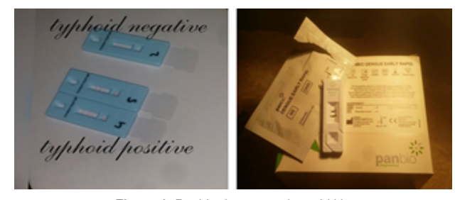
Figure 1: Panbio dengue early rapid kit.

In our performed study blood samples were collected in a gel tube from the disease suspected patients then the samples were allowed to centrifuge with the help of centrifugation machine at 4000 rpm (rotation per minute) and were separated required serum from blood sample The serum samples were tested with their respective offer which is given by the physicians. For Dengue NS1 test we used panbio dengue early rapid kit with their sensitivity rate is 91.89% and specificity rate is 98.39% and for the typhoid we used TYPHIDOT Rapid IgM by reszOn diagnostics international with their specificity rate is 85.9% and sensitivity rate is 96.7% respectively (Figure 1).