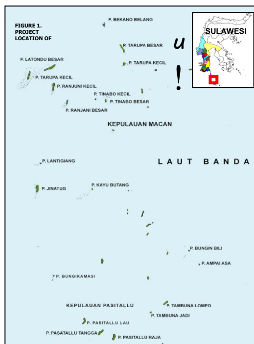
Figure 1. Project Location of Taka Bonerate

The survey was carried out at three villages, included two villages inside TN-TBR, i.e. Ranjuni and Tarupa, and one village outside TN-TBR, namely Kayuadi village ( Figure 1 ). This was conducted for about 3 weeks, between 7-26 November 2000.