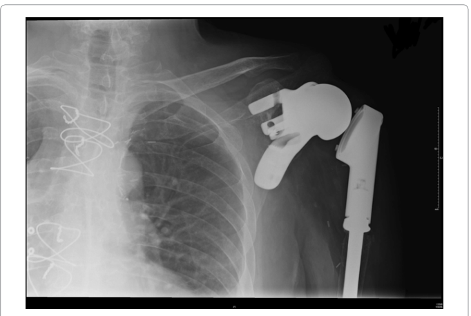
Figure 2: The post-operative AP radiograph demonstrates replacement of the constrained-type arthroplasty with a custom total reverse style arthroplasty. Note the glenoid and stem components were preserved from the previous surgery.

Although severe impairment of deltoid function is a relative contraindication to rTSA, we present a case where such an implant was used in a patient who had no deltoid muscle or active latissimus. Currently accepted indications for rTSA include rotator cuff tear arthopathy (CTA), proximal humeral neoplasms, non-union fractures, and as revision procedure for failed traditional replacement or hemiarthroplasty [3-6].