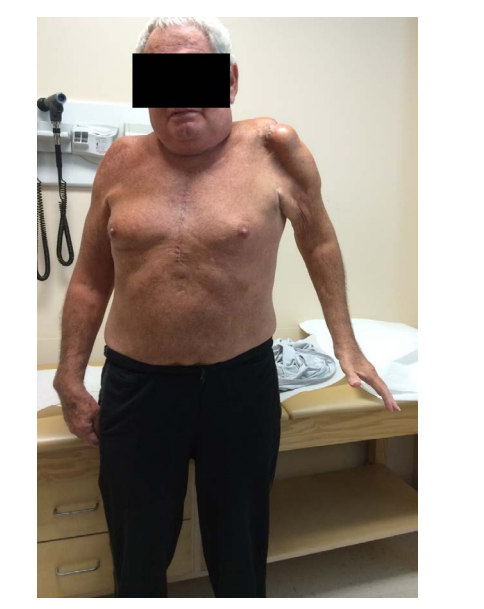
Figure 4: Patient at maximum abduction after custom reverse total shoulder with no deltoid or remaining shoulder gridle.

A completely deficient deltoid is thought to be a strong contraindication to rTSA, specifically if dysfunction includes the anterior head. A cadaveric study has demonstrated that balanced abduction is severely disrupted if both segments of the anterior deltoid are impaired [7]. However, another cadaver study by Gulotta concluded anterior deltoid deficiency can be compensated by both the subscapularis and middle deltoid during elevation to 60° [8]. Seemingly, both the anterior and middle deltoid contribute to function in rTSA, although the anterior head is responsible for a larger burden of the function. Groh described a series of 36 patients with deltoid deficiency after various shoulder operations, of which 25 had loss of the anterior or anterior and middle heads; 28 reported fair or poor shoulder function as determined by activities of daily living [9]. Tay reported on one case of rTSA for CTA and concurrent irreparable middle deltoid avulsion with good outcome [10]. Schneeberger performed rTSA on 19 patients who failed deltoid flap reconstruction for irreparable rotator cuff tears. These patients all had a substantial defect in the anterolateral portion of their deltoid from the flap reconstruction surgery. All had objective improvement as measured by the Constant score and all were either very satisfied (15/19) or satisfied (4/19) with the result [11]. Thus, partial deltoid impairment, even in the anterior head, is not an absolute contraindication to rTSA [12].