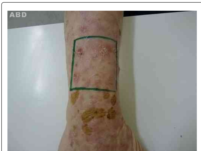
Figure 3: Lesions in the left forearm measuring about 2 cm.