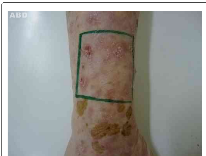
Figure 2: Expanded vision of lesions, allowing visualization of flaking and redness.