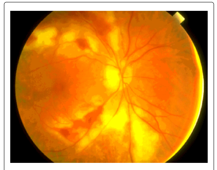
Figure 1: The picture is showing perivascular haemorrhage and exudates characteristic of CMV retinitis. This is often described as "Cottage Cheese with Tomato Ketchup" appearance.

Investigations revealed a total count of 4700/mm, haemoglobin 8.2 gm/ dl, a microcytic hypochromic blood picture. LDH was 110U/L. Mantoux test and sputum for acid fast bacilli were negative. X ray showed bilateral chest infiltrates (Figure 2). Routine oral swab was taken for examination.