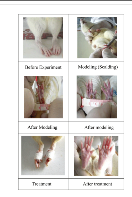
Figure 3: Foot Scald group