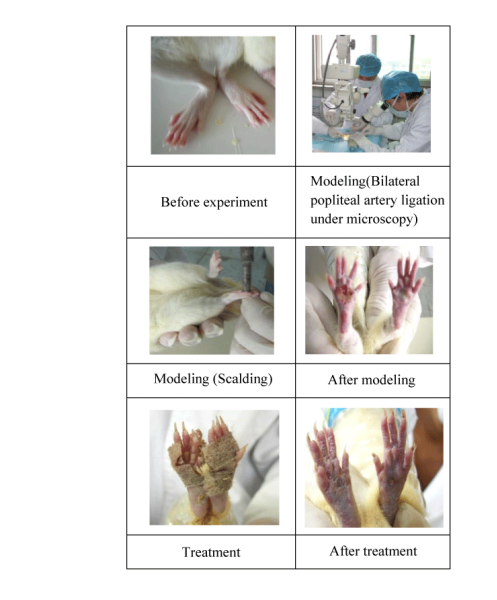
Figure 5: Bilateral lower end of the popliteal artery ligation with Scalding group.

Figure 4: Bilateral lower end of the popliteal artery ligation group.