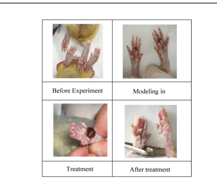
Figure 2: Control group

Purulent secretion were seen in twelve rats (80%) in Group C. Compared with Group A has statistically significant difference (P<0.05) as showed in Table 1.