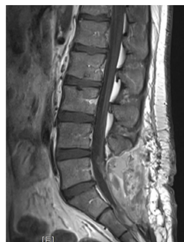
Figure 3: Postoperative MRI showing complete removal of the lesion.

Although MRI can identify the intradural extramedullary lesions, it is not diagnostic and the differential diagnosis includes schwannoma, ependymoma, meningioma or solitary metastasis [21,22]. However, some findings are helpful in diagnosing a paraganglioma. Spinal paragangliomas include low/intermediate signal intensity on T1-weighted sequences and intermediate/high signal intensity on T2-weighted sequences in comparison with neighbouring paravertebral tissues (Figures 1a,1b and 1d). After Gd injection, there is marked enhancement; in some cases a "serpiginous flow voids" is observed, which suggests vessels capping the tumor. Araki et al. [3] suggested that this sign is a major clue to the diagnosis of a highly vascular lesion. Hypointense tumor margins on T2-weighted MR and proton-