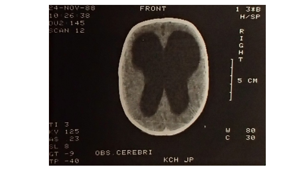
Figure 1: At the age of three control CT scan showed regression of hydrocephalus.

Now due to the traits of the increasing intracranial pressure such