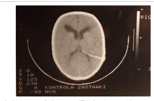
Figure 2: At the age of 12 was qualified for shunt revision, an exchange of peritoneal catheter, due to increased ICP syndrome.