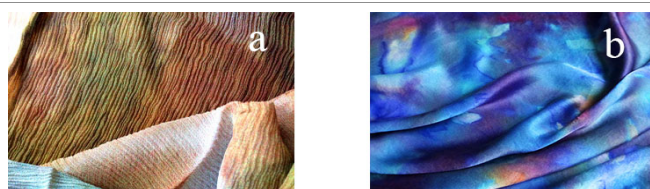
Figure 2: Color presentation on two fabrics (self-painted) (a) Color presentation on georgette (b) Color presentation on satin.