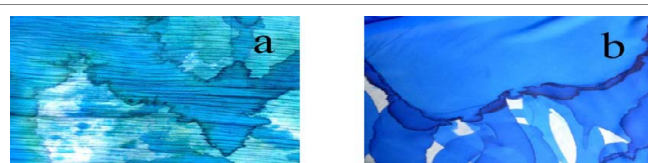
Figure 5: Texture of edges on two fabrics (self-painted) (a) Texture of edges on georgette (b) Texture of edges on plain satin.