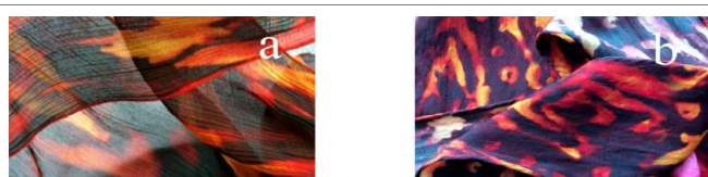
Figure 3: Color overlays on two fabrics (self-painted) (a) Color overlays on georgette (b) Color overlays on satin.