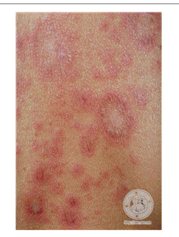
Figure 1: Cutaneous involvement in DIL

They are both autoimmune based diseases but have different pathogenetic mechanisms. Pathogenesis of DIL is not completely understood but a genetic susceptibility may be decisive, as it is the case with procainamide or hydralazine [4-7]. This review discusses the