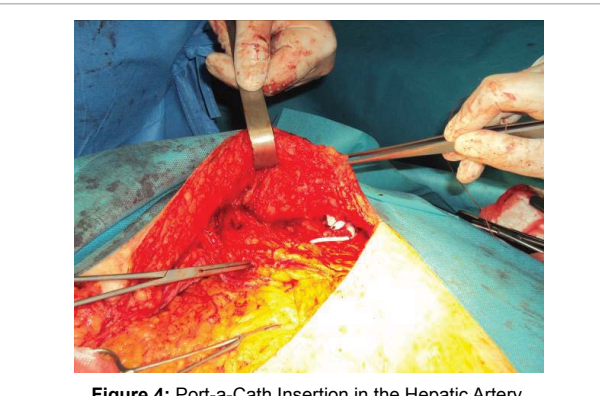
Figure 4: Port-a-Cath Insertion in the Hepatic Artery.

port") on the inferior part of the right rib cage on the same layer as the medial-clavicular line, taking into consideration the fact that the entire capsule should be placed on the hard layer of the last ribs of the rib cage. In order to accomplish this separate skin incision made, at approximately 3-5 cm proximal to the chamber's positioning spot and the dissection of the subcutaneous layer to the muscular-aponeurotic layer of the costal margin of the last ribs. This dissection is done distally of the incision, in order to avoid the over-positioning of the incision, and so of the future scar, over the spot of the future injections of the capsule. Through dissection, a subcutaneous pocket is created in which we will place the capsule and fix it with three suture points to the muscular-aponeurotic layer. The maneuver is necessary in order to avoid a possible migration or subcutaneous torsion of the capsule, thus being impossible to use it for injections in the future.