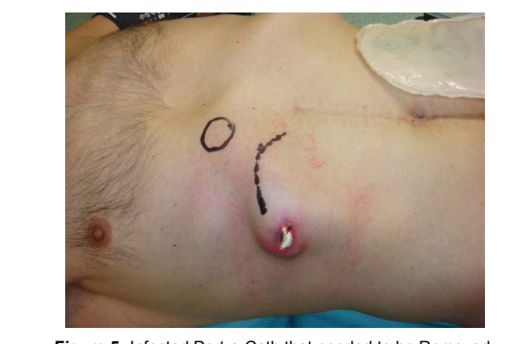
Figure 5: Infected Port-a-Cath that needed to be Removed.

administration in the hepatic artery of Oxaliplatin was implemented for these patients. In the present study, among the primary objectives such as response rate and progression free survival, we also considered secondary objectives such as toxicity profiles, safety and, in some cases, the target was the ulterior possibility of resectability of the hepatic metastasis in case of a good response to chemotherapy. The present paper addresses one of the secondary objectives that of the safety of the procedure, taking into account the fact that it is not a standardized treatment option for these patients.