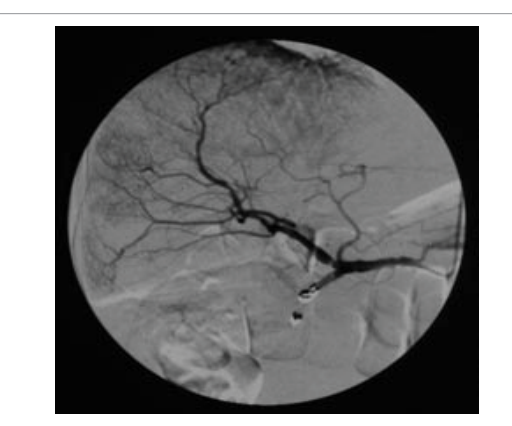
Figure 1: The Arteriography made Indicates the Correct Position of the Catheter in the Common Hepatic Artery.

After the correct positioning of the catheter in the hepatic artery we will proceed to the chamber positioning (capsule, the "infusional