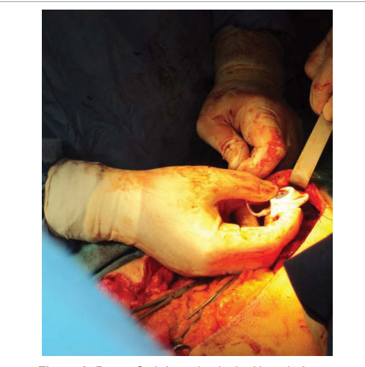
Figure 2: Port-a-Cath Insertion in the Hepatic Artery