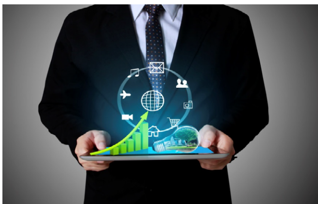
Figure 2: Global marketing.