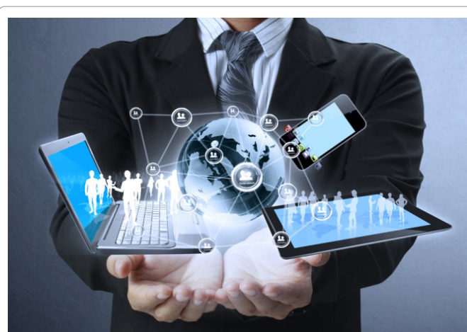
Figure 3: Use of smart technology.

brought human closer and also allowed the usage of the resources and the necessary things in daily life. Some of the leading companies are showing huge dependence on the smart technologies. Compare to the past man has made many advances with smart techniques. Mainly laptops, I pads, mobiles made huge contribution to the world in all aspects, these activities lead to the company growth and economy of the country. Smart applications made the service providers closer to the public which in turn helped in regular activities, such as, paying bills, advance booking for travelling, entertainment, food and other online transactions. Now-a-days banks are also part of the smart technology which helped in making all transactions from respective banks in an easier way. Figure 3 shows the use of smart technology.