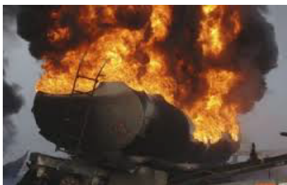
Figure 3: Blast tanks in oil and Petroleum Industries.