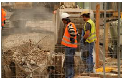
Figure 4: Metal and Mechanical Fall downs.