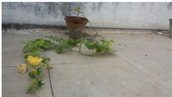
Figure 2: Plant sprouted from Control seed.

After 30 days the smoked plants along with control are observed for response of crab shell fogging. Certain parameters like Height, size of leaf and number of flowers are considered for result study in the plant. Results are tabulated in Table 2 (Figures 2-4).