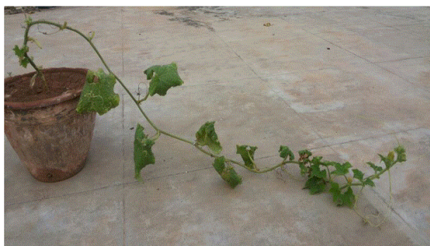
Figure 3: Plant sprouted from seed treated with chitin.