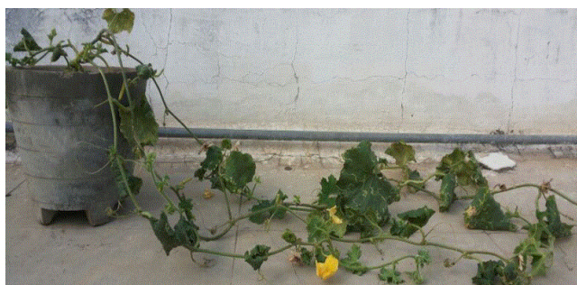
Figure 4: Plant sprouted from Test seed prior smoking.