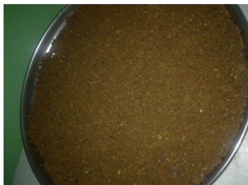
Figure 3: Date palm fruit pulp.