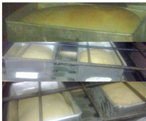
Figure 4: Bread samples during baking.