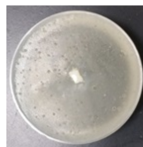
Figure 2: Enamel chip embedded for microhardness testing.

The demineralized chips were then attached to the palatal surface of each retainer with approximately 0.75 to 1.5 cm separation between them and left in place over the duration of that arm of the study (5 days). At the end of each arm, samples were detached from the retainer for microhardness measurements consisting of 3 individual microhardness indentation measurements in Knoop units (Figure 2). Microhardness (Knoop) data points were collected using indentation measurements at 3 locations per sample: one in an area of typical appearance, one in an area with the healthiest (best) appearance, and one in an area with the most damaged (worst) appearance.