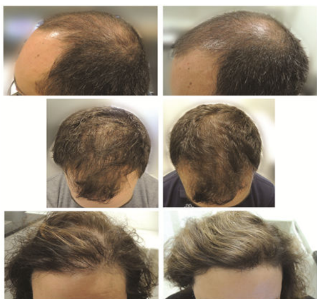
Figure 3: Global photographs of subjects 26 (above), 11 (middle), 29 (below) at Time zero (left) and after 6 month of treatment (right).

Global photograph review: Photographs review and analysis show an interesting improvement of hair density already at T 3 ; however, the major variances can be appreciated at T 6 . After 6 month treatment 83.3% of subjects experience an increased hair density (Table 4). Reference photographs are shown in Figure 3.