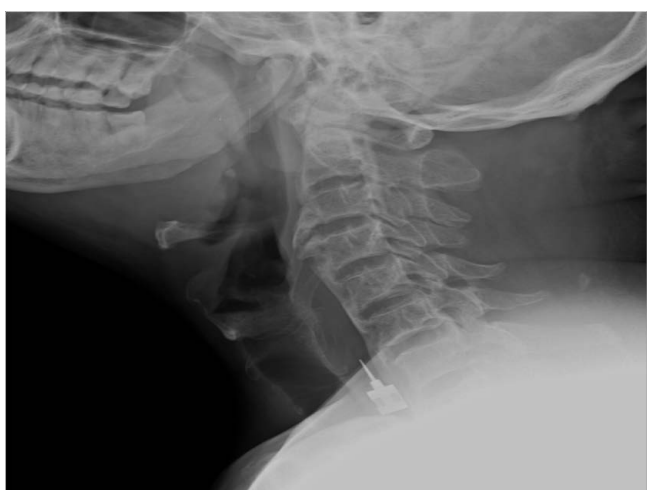
Figure 2: Pre-operative lateral X ray view showing radioopaque object (catridge head of airtor with bur attached) impacted in the region of cricopharynx at the cervical vertebral level of C6-C7. The prevertebral widening at C6-C7 is observed.

the dental armamentarium like the airtor has to be manually checked regularly to examine its quality and functional condition. In the present case report, the airtor used was earlier malfunctioning and returned from the repair but was failed to be rechecked before the operative procedure by the dental assistant. A thorough scrutinization of the airtor's condition would have prevented the mishap.