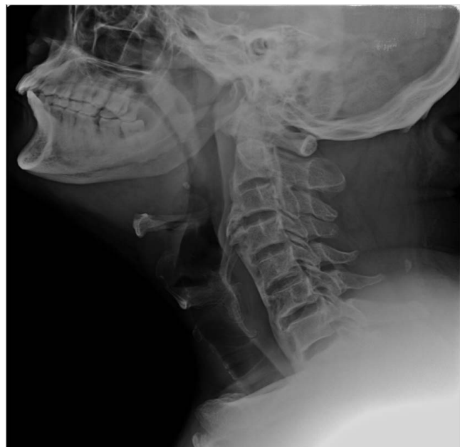
Figure 3: Post-operative lateral view X ray showing the complete and mutilated removal of the radioopaque object (catridge head of airtor with bur attached) from the cricopharyngeal region. The absence of prevertebral widening at C6-C7 is noted.

Foreign objects tend to get impacted at the level of cervical oesophagus due to its natural constrictions. The 3 anatomical constrictions are crico pharyngeal ring, aortic arch narrowing which extends to almost 13-15 cm and oesophago gastric junction [3,4]. Swallowing test (pain on drinking water) and tracheal rock (moving of trachea side to side) suggests the presence of foreign body in oesophagus [4]. These tests exclude the possibility of aspiration of foreign object in to the respiratory system and helps in clinical distinguishing of the object impaction site. Clinically the cervical oesophageal foreign body impaction may lead to airway obstruction, violent cough, chest pressure, dysphagia, and odynophagia [8]. Long term retention of object leads to oesophageal mucosal inflammation, perforations, retropharyngeal