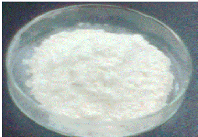
Figure 4b: Different three forms of gum: Spray dried powder.