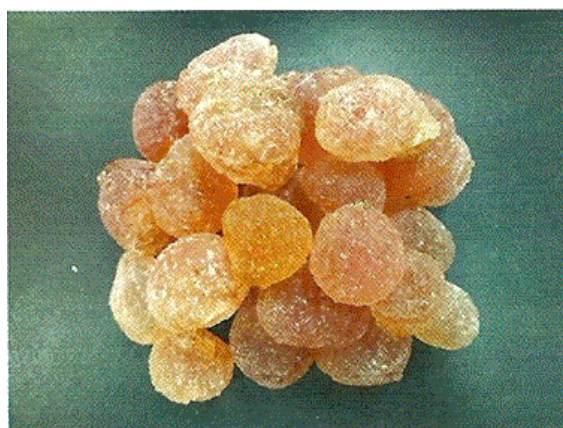
Figure 3: Hands pick raw gum.

As seen in the chart it was clear that the granulated form dissolves more easily and reaches a statistically significant large amount compared to the other two forms simultaneously. Upon referral to the international pharmacopeias the reported that the maximum accepted time for disintegration of tablets is 15 min. The granulated form spent less than 5 min compared to the other forms which were 20 min to 2 h. Therefore the granulated form is highly effective to be used in tablet formulation as binder, in suspension as a suspending agent, as coating agent, in eye drops formulation (Natural Tears), in addition to its utility as dietary supplement in tablet form. As far as the microbial test is concerned, it is evident in Table 2 above that the results are similar to the international standards in having no growth of Escherichia coli and Salmonella in the various culture media (Figures 2-4).