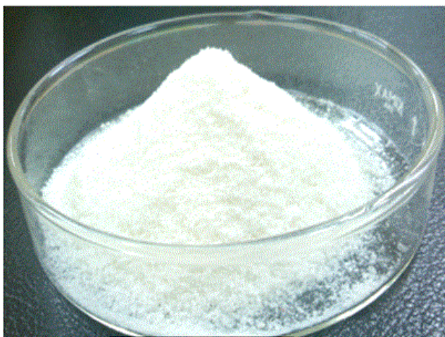
Figure 4c: Different three forms of gum: Instant soluble granules.