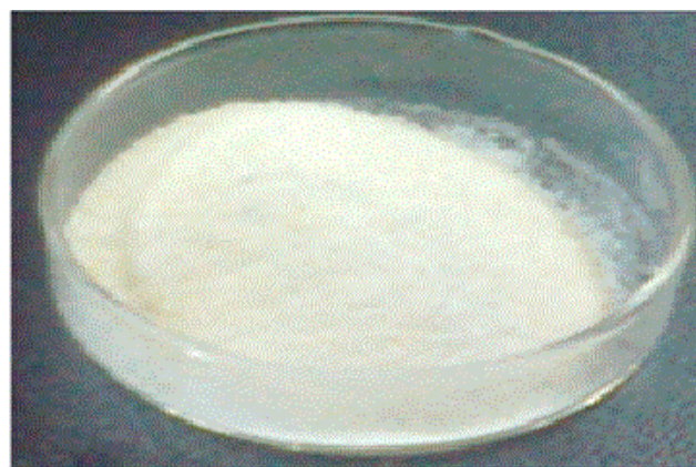
Figure 4a: Different three forms of gum: mechanical ground powder.