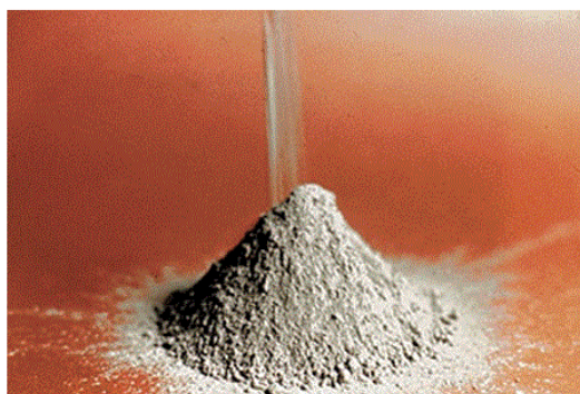
Figure 2: Portland cement.

proportion of the lead content in plant tissues. The soil and organic litter layer components of woodland ecosystems are the ultimate sinks of heavy metals in aerially contaminated areas. It is now known that the major part of the ecosystem shows high level of contamination [7].