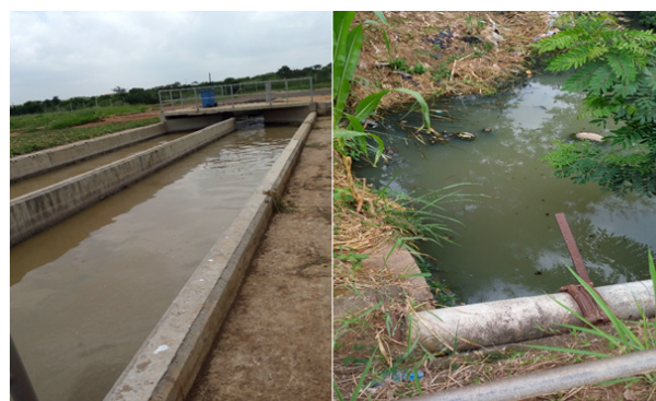
Figure 1. Sites for sample collection in Ghana: left) inlet of sewer lines to sewage processing plant at Legon and right) drainage site at Koforidua in the Eastern region.

In the Eastern region however, only one site was identified at Akosombo in the Asuogyaman district with proper open sewage channel and treatment system that serves a population of about 17,000 inhabitants. This channel receives sewage via 3 smaller and medium-sized sewage channels that drain residential areas. The other identified site was a drainage that runs through many areas and receives waste water from large areas within Koforidua (Figure 1).